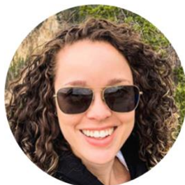
TIFFANY THE STOKE FAM