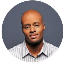
DRE BALWIN AUTHOR OF THE MIRROR OF MOTIVATION

This is the #1 killer of relationships, when people treat the engagement more like a transaction than a relationship. They're more focused on things being "even" than just doing good for each other because of genuine care for a person.